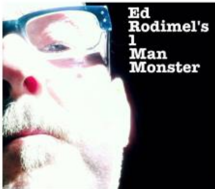
I Man Monster will start at Noon