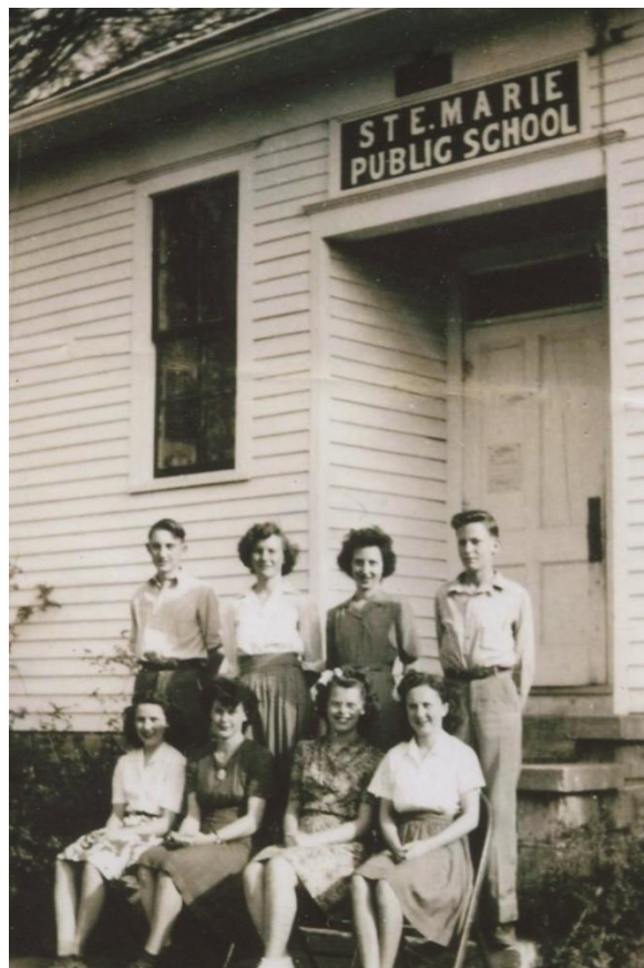
Pix: This is a high school sophomore class in front of the Ste. Marie Public School in 1945. (where Parish Center is now).